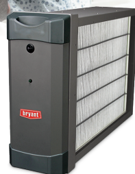
Evolution™ Air Purifier