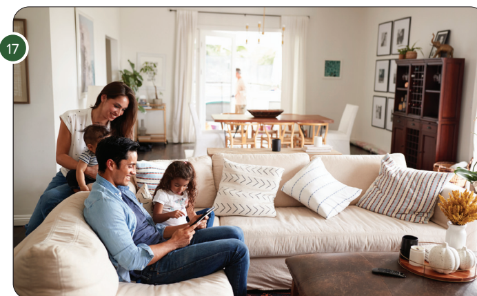
DIVERSE FAMILY RELAXING AFTER HOME IMPROVEMENT PROJECT. And there's just no improving on that.