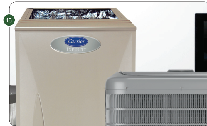
...with smart technologies and a whole home air purifier...