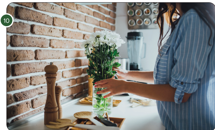
10 MOM PUTTING FINISHING TOUCH TO ROOM. Of all the improvements you can make to your home...