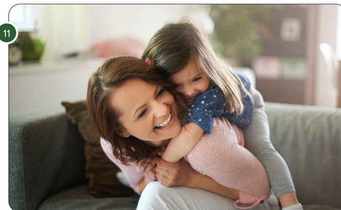
11 MOM SITTING DOWN ON SOFA AND RELAXING WITH HER PHONE WHEN HER CHILD RUNS AND JUMPS ON HER TO SNUGGLE. ... it could be the most important one is not seen or heard...