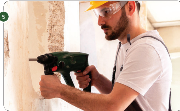
CONTRACTOR AT WORK, TBD.