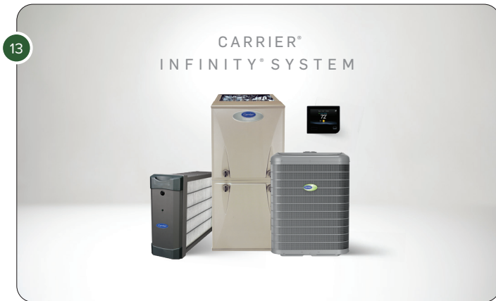
CUT TO BEAUTIFUL HERO SHOT OF INFINITY SYSTEM GROUPING. Discover premium comfort with the whisper-quiet, energy-efficient Carrier Infinity home comfort system.