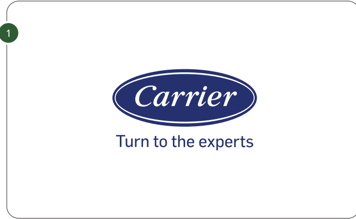
OPEN ON CARRIER LOGO.

Exact home improvement activities depicted dependent on location, talent and budget parameters.