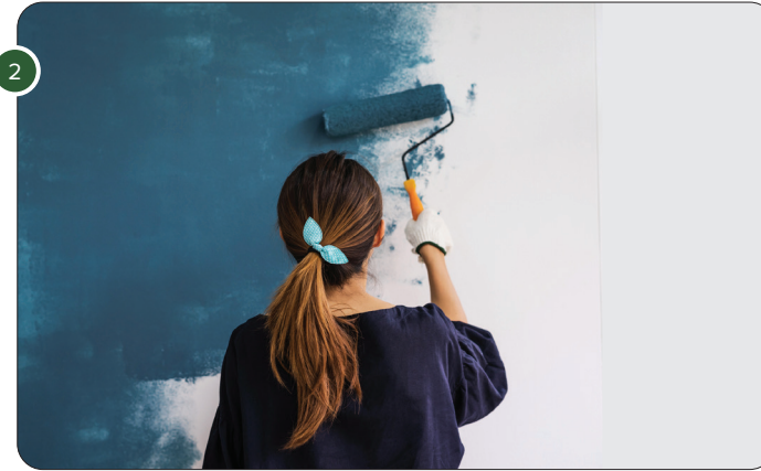
QUICK CUTS OF CLOSE-UPS ON HOME IMPROVEMENT PROJECTS, WITH ALL THE ACTION SYNCED IN A COOL WAY (UP/DOWN, LEFT/RIGHT, ETC.)