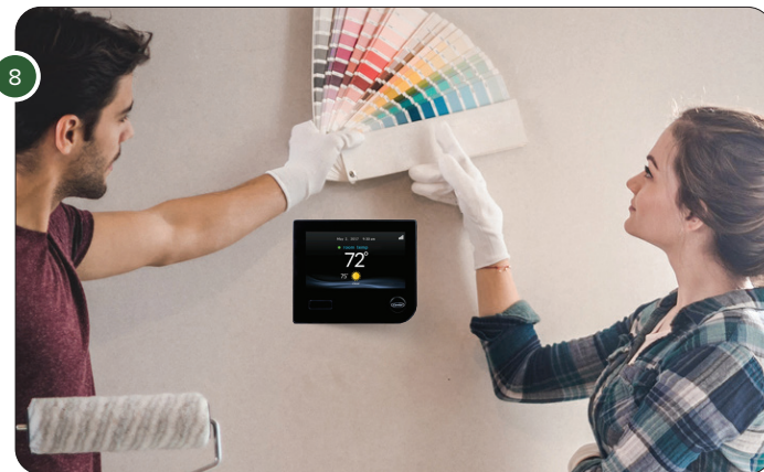
8 LOOKING AT PAINT SWATCHES.