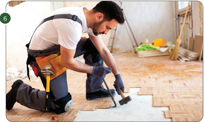
LAYING TILE FLOOR.