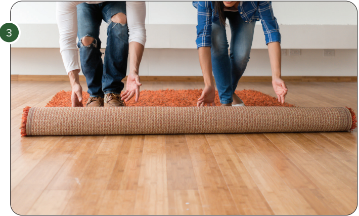
ROLLING OUT NEW RUG.