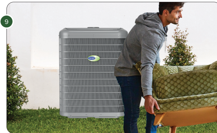
9 CARRYING NEW COUCH PAST AC UNIT.