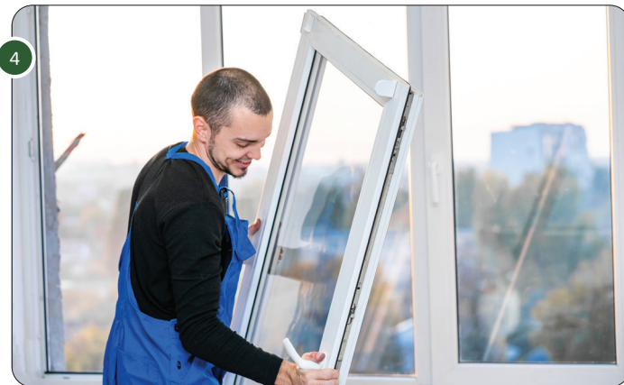
CONTRACTOR AT WORK, TBD.