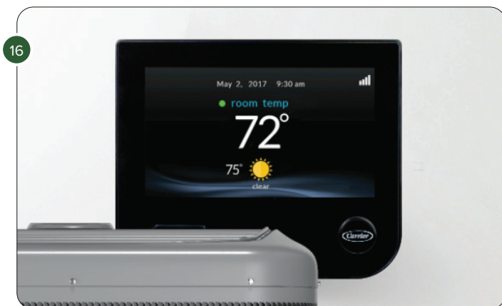
...that give you confidence you're breathing healthier air.