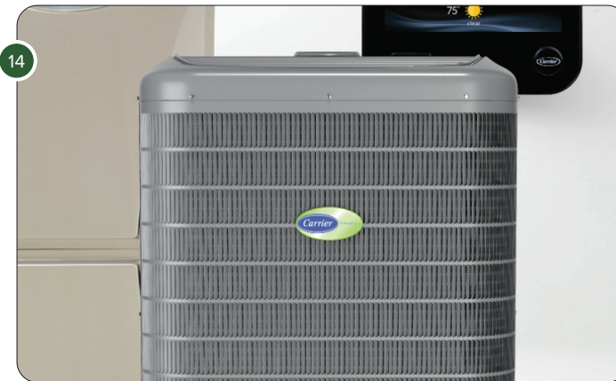
DRAMATIC BEAUTY SHOTS OF EACH UNIT. It's an essential part of any healthy home,...